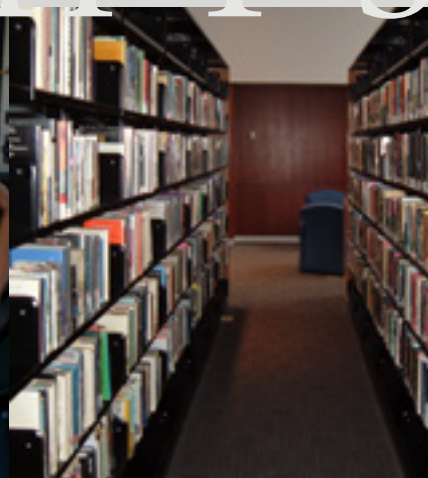
Ride to Read 2014