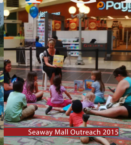
Seaway Mall Outreach 2015